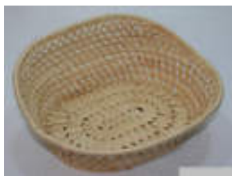
18-702 (70入) (28×34×12) (パーム小判測上がり) ¥800