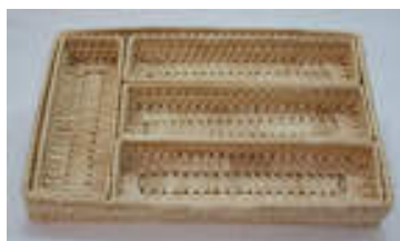
18-201 (30入) (27×39.5×6) (パーム容器5点セット) ¥1,800