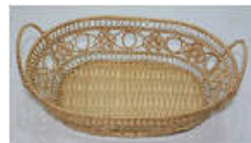
18-186 (63入) (24.5×34.5×9)×15 (カザリ小判耳付盛り大) ¥1,000