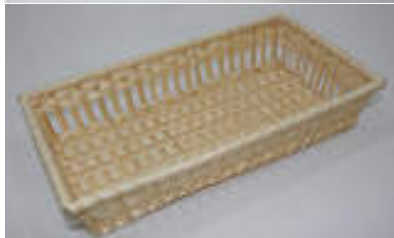
18-170 (240入) (15×28×5) (白竹スカシ細長) ¥290