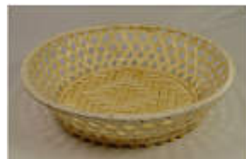
18-263 (160入) (φ22×6) (白竹ミジン丸) ¥270