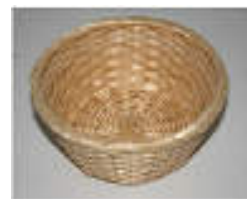
18-454 (280入) (φ14.5×4.5) (白竹丸) ¥180