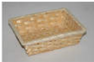
18-981 (500入) (12.5×16×4.5) (白竹角長籠) ¥170