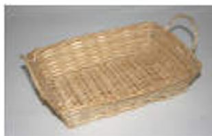
18-455 (250入) (15×20.5×5) (白竹角長) ¥200