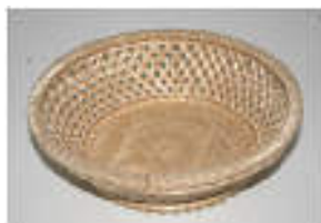
18-554 (350入) (φ15×5) (六ツ目丸) ¥180