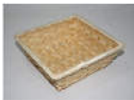
18-452 (460入) (14×14×4.5) (白竹角) ¥180