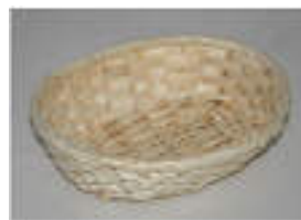
18-453 (420入) (13.5×18×5) (白竹小判) ¥180