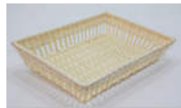
18-171 (300入) (14×22×4.5) (白竹角長スカシ中) ¥220