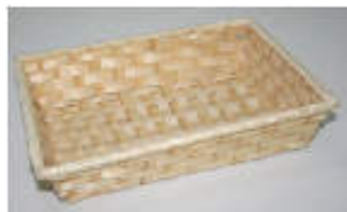
18-303 (250入) (18.5×24×5) (白竹角長籠 中) ¥210