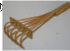
27-432 (7) (熊手) ¥240