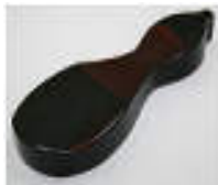
27-410 ㊤ (6) (ひょうたん) ¥400