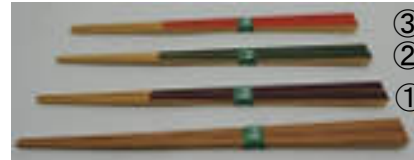
27-071 ㊤ (23) (スス竹磨き箸) ¥550