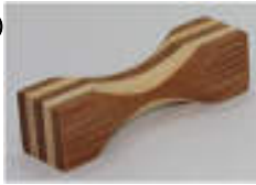
27-401 ㊤ (7) (つづみ) ¥230