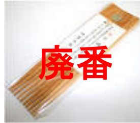
27-604 ㊤ (21.5) (姫箸白5膳入) ¥500