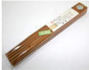
27-603 ㊤ (21.5) (スス10膳ハック) ¥1,150