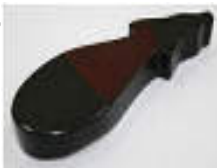
27-411 ㊤ (6) (なす) ¥400