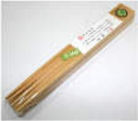
27-602 ㊤ (21.5) (白10膳ハック) ¥1,100