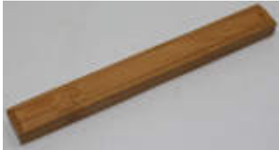
30-144 ㊤ (3×25×1.8) 内寸(1.8×24) (スス箸箱) ¥1,650