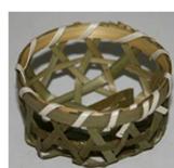
30-007 (φ 5 × 2) (妻籠) ¥ 80