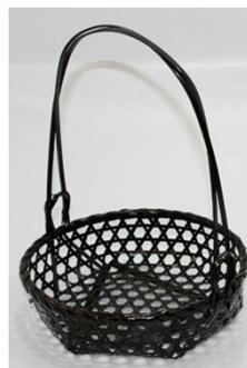
30-083-1 (φ 20 × 4.5) × 27 (染六ッ目柄付大) ¥ 870