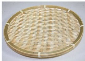
14-577 (φ 22.5) (ヒゴ丸皿) ¥ 270