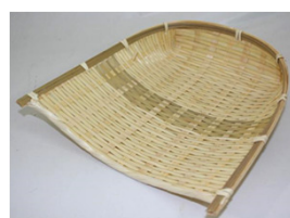
14-904 (22 × 24 × 7) (柁ミ一大) ¥ 240