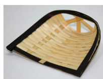
30-054 (9 × 9 × 3.5) (ミ一 9cm) ¥ 80