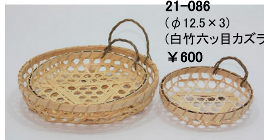
21-086 (φ 12.5 × 3) (白竹六ッ目カズラ小) ¥ 600