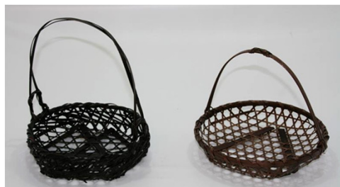
21-285-1 (φ 20 × 4) × 22 (染ワカナ籠大) ¥ 650