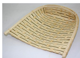
14-903 (20 × 20.5 × 5) (市松ミ一) ¥ 240