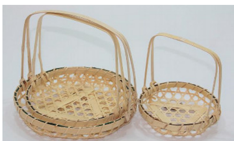
21-085 (φ 19 × 3.5) × 16.5 (白竹六ッ目柄付大) ¥ 930