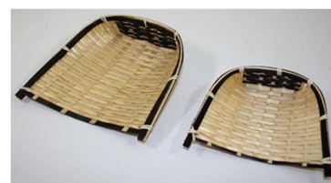
21-021 (14 × 15.5) (ミ一大) ¥ 170