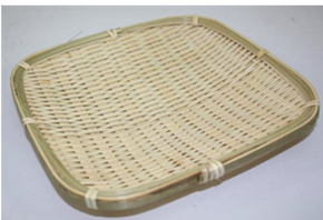
14-576 (21.5 × 22) (ヒゴ角皿) ¥ 270