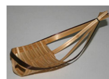
30-033 (5 × 11) (スカシ舟) ¥ 45