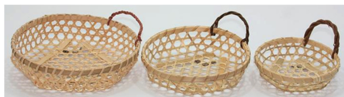
21-107 (φ 19 × 3.5) (カズラ付六ッ目大) ¥ 370