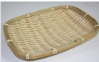
14-579 (17.5 × 23) (ヒゴ角長皿) ¥ 270