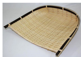
14-902 (22.5 × 24 × 6) (白ミ一大) ¥ 240