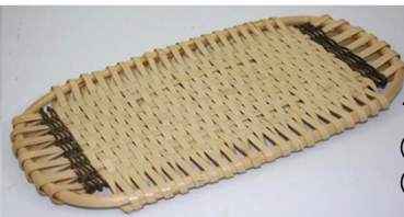
14-011 ㊵ (14 × 23) (天ぷら皿角長) ¥ 640