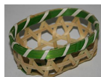
30-227 (5.5 × 7.5 × 3) (六ッ目小判) ¥ 80