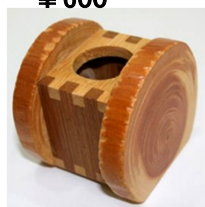
33-068 (5×7.3×5.5) (楊枝立車) ¥600