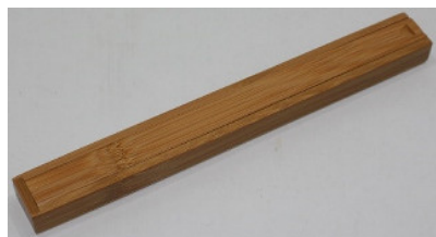
30-144 ㊤ (3×25×1.8) 内寸(1.8×24) (スス箸箱) ¥1,750