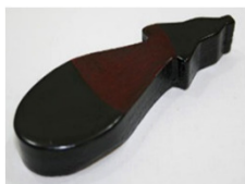
27-411 ㊤ (6) (なす) ¥400