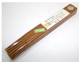
27-603 ㊤ (21.5) (スス10膳パック) ¥1,200