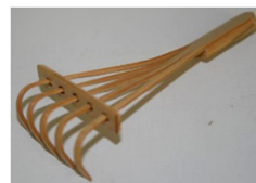
27-432 (7) (熊手) ¥260