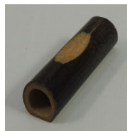
27-407 ㊤ (4.5) (箸置き 黒竹) ¥150