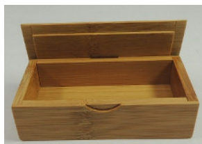
30-145 ㊤ (5.2×10.2×2.7) (スス竹磨き楊枝入れ) ¥1,300