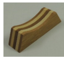
27-402 ㊤ (6) (箸置き 末広) ¥200