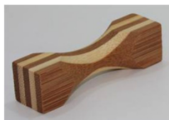
27-401 ㊤ (7) (つづみ) ¥230