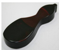
27-410 ㊤ (6) (ひょうたん) ¥400