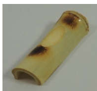
27-408 ㊤ (6) (箸置き かまぼこ) ¥150