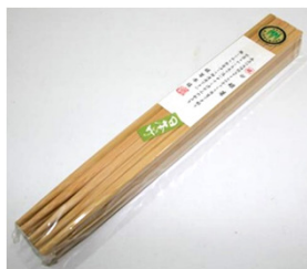
27-602 ㊤ (21.5) (白10膳パック) ¥1,150