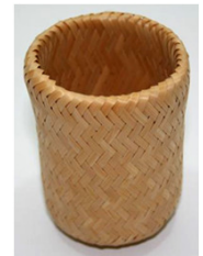
31-767 (φ7×9) (二重編細) ¥270