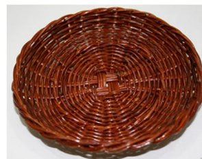
24-410 (φ11.5) (アケビ茶托) ¥50