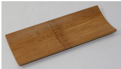
23-015 ㊦ (7×18) (ススおしぼり受) ¥700