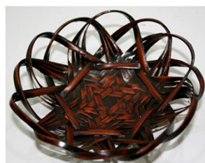
24-190 (φ11.5×3.5) (染花型茶托) ¥520