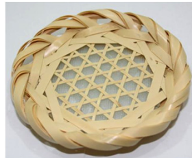
24-029 (φ10.5) (荒六ツ目茶托) ¥600