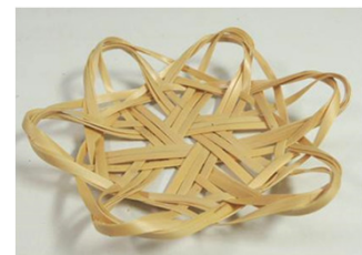
24-499 (φ11.5×2) (ききょう茶托) ¥500