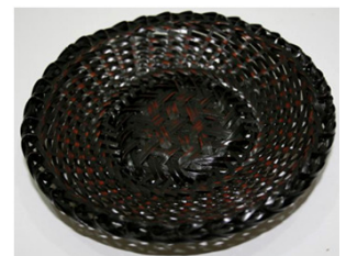
24-888 (φ13×2.5) (都茶托) ¥450