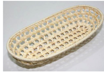
23-004 (9×17×3.5) (籐小判絞入) ¥270