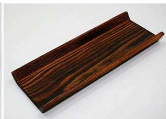
23-013 (6.7×17) (焼き杉絞入) ¥670