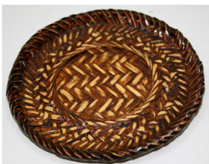
24-126 (φ11) (染アジロ茶托) ¥240