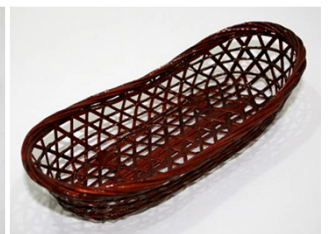
23-294 (7×17) (絞カシユ塗舟型) ¥550