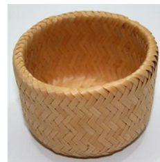
32-768 (φ9×6.5) (二重編太) ¥270