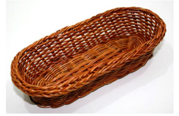
23-163 (8×17.5×4) (芒草小判絞) ¥200