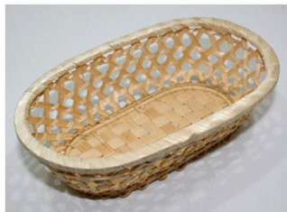
23-244 (8.5×16.5×3.5) (絞六ツ目白) ¥220