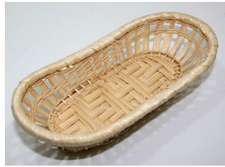
23-260 (8×17.5) (絞立差し白) ¥220