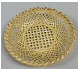
99-066 ㊦ (φ11.5×2) (うずら茶托) ¥2,000